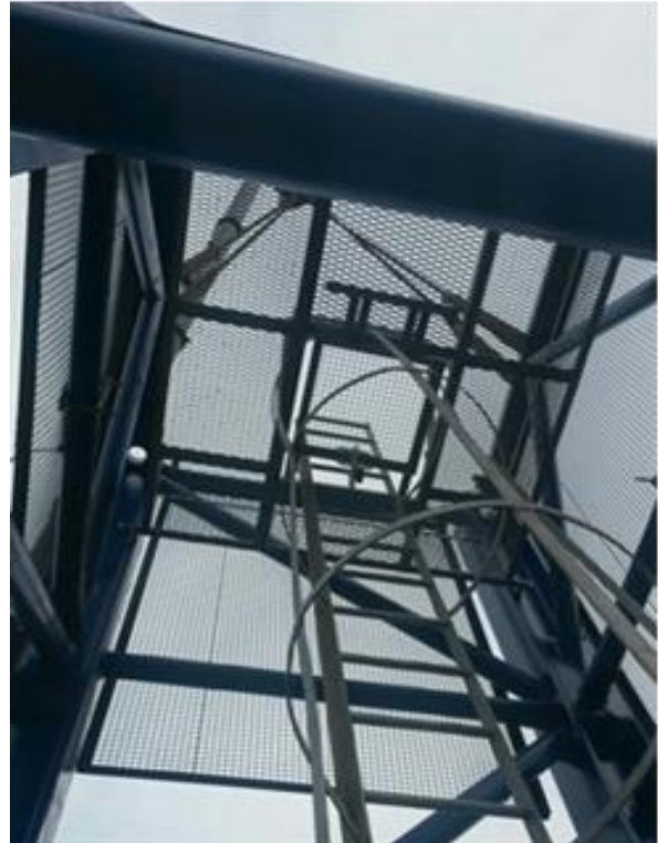
Figure 6 - Anti-climb Panels and Trapdoor