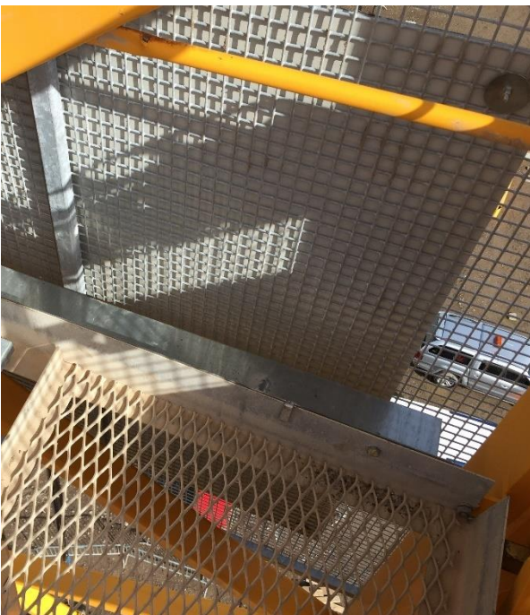
Figure 10 – Toe board Infill