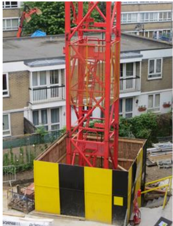
Figure 10 – Toe board Infill