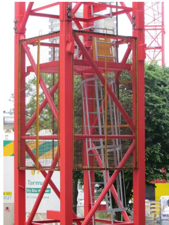
Figure 12 – Example of Anti-climb Panels