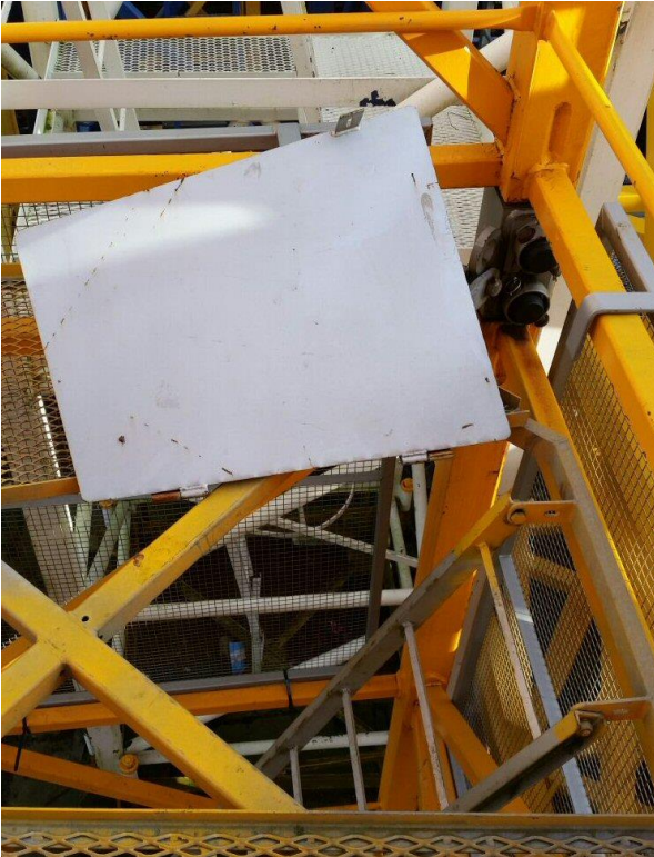
Figure 8 – Trapdoor