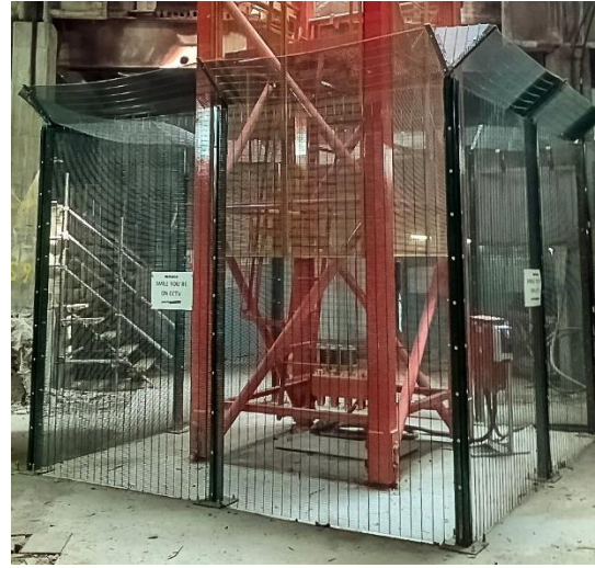
Figure 2 – Improved Base Enclosure