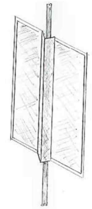
Figure 7 Anti-climb Panel with Cable Duct