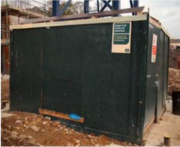
Figure 1 – Base Enclosure