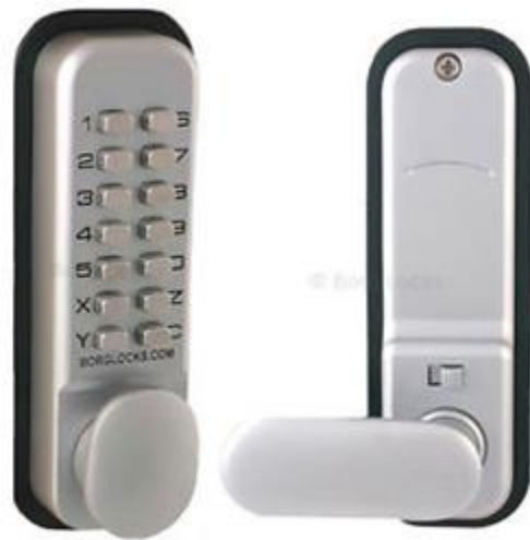
Figure 4 - Trapdoor and Base Enclosure Lock