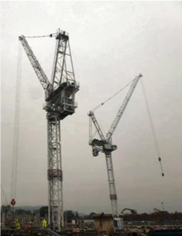
Figure 5 - Anti-climb Panels