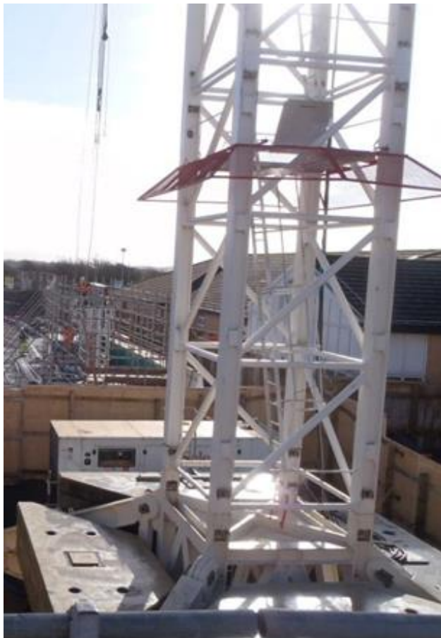
Figure 3 – Anti Climbing Fan